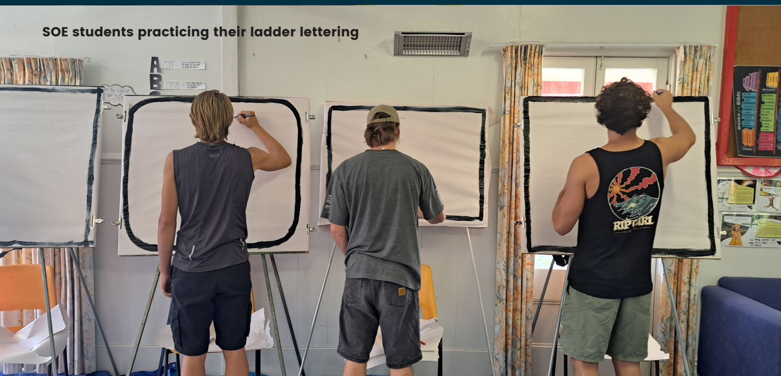
SOE students practicing their ladder lettering